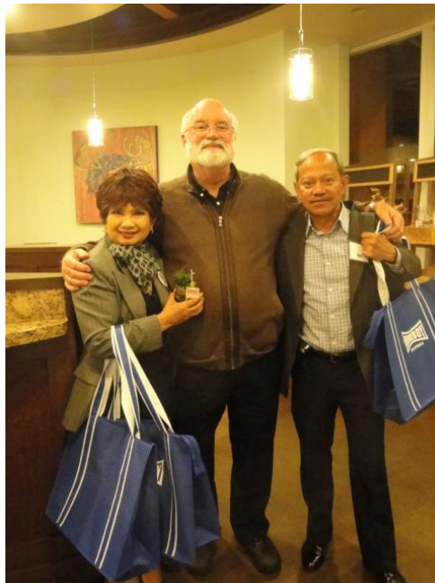
Learning about Homeboy Industries from Father Greg Boyle