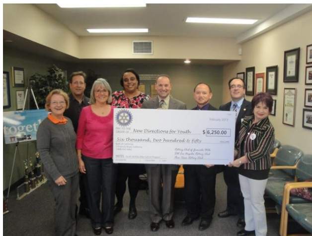
New Directions for Youth, Inc. is dedicated to providing comprehensive programs and services to at-risk youth and their families. Its vision is a peaceful community where youth and families thrive and grow.